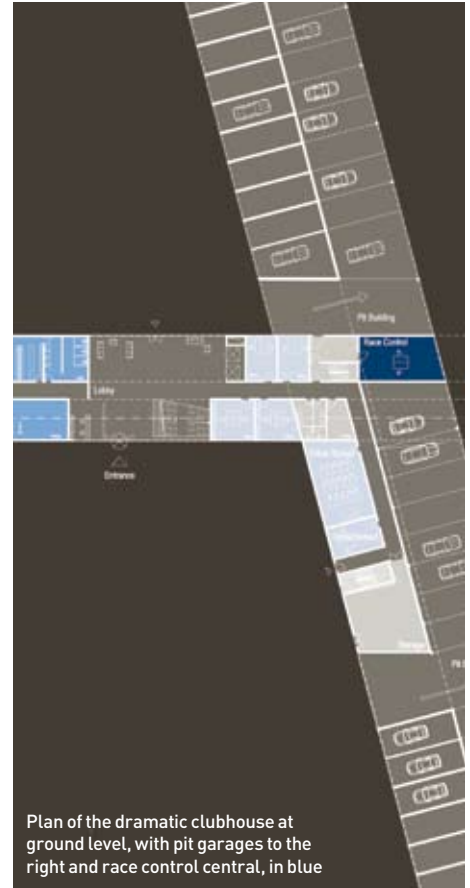
Plan of the dramatic clubhouse at ground level, with pit garages to the right and race control central, in blue