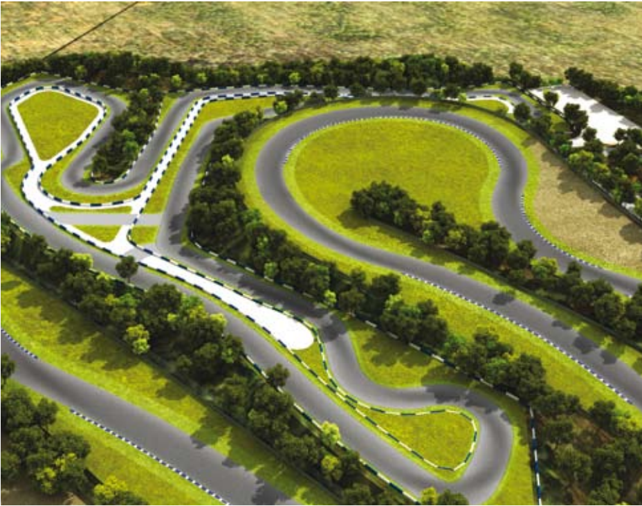
Detail view of the undulating, 0.79-mile kart track at AMP

track lighting system from Inis Motorsport, which will be completely solar-powered. In addition, recycled materials will be used to build the track and guardrails.